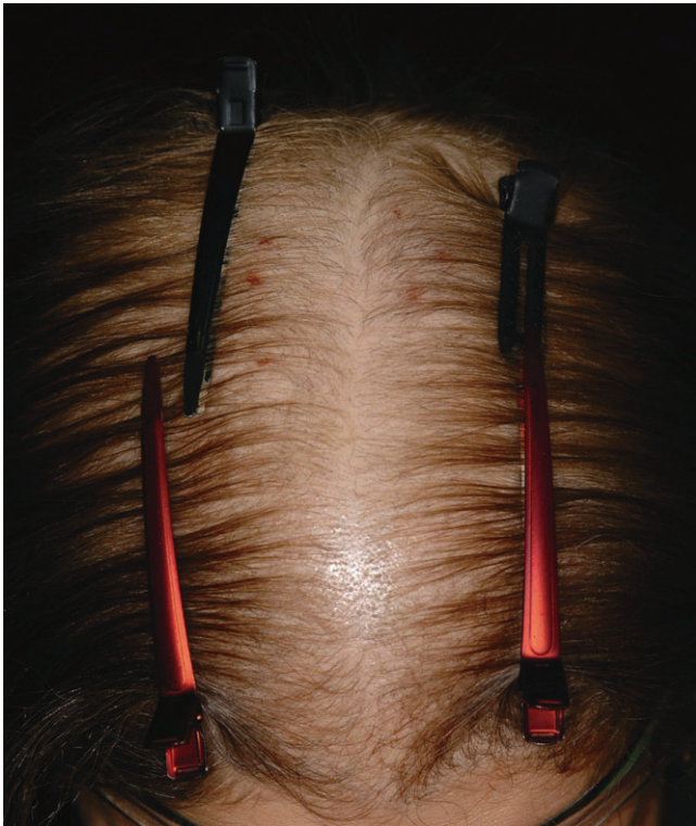
Figure 1 Baseline global scalp photograph demonstrating Sinclair grade 4 hair loss.